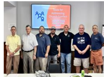
Deacon Training, August 26