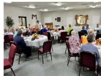
NABS Luncheon hosted by Adamsville, September 21