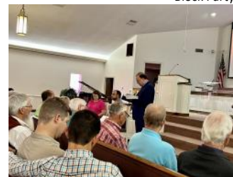
Deacon Ordination Service at Rivermont, September 24