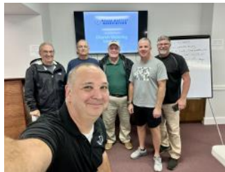
La Grange FMBC Leadership Team attended the Church Visioning Intensive, Sept 22-23