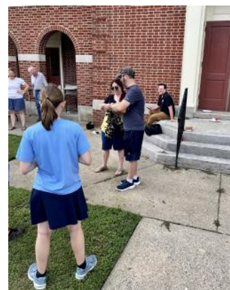
Madison Avenue hosted a neighborhood Block Party on September 8